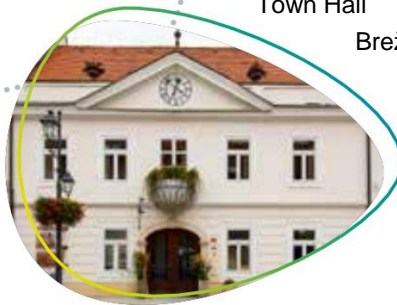
Town Hall Brežice

The reinforced concrete bridge over the confluence of Sava and Krka, 524 meters long, was among the longest in Austria-Hungary. Actor Jackie Chan also filmed action scenes for the movie Armor of God on it.